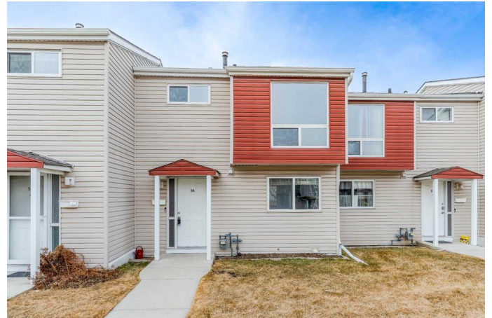
36-5425 Pensacola Crescent SE, Calgary, AB

LOWEST priced townhome OR apartment in Calgary, with 1100+ square feet, 3 Bedroom 1.5 Bathroom. RARE 2-Storey Townhome with partially framed and drywalled Basement rooms, full Laundry Room, Fenced Yard with concrete Patio and Pergola, ready for installing spring sod or summer gardening, plus backing AND facing Green Spaces and paths - enter Penbrooke Gardens via Pensdale Road for closest parking & path to unit entrance. Most Units at this price are 1 or 2 Bedroom, and half the size, not suitable for family needs, close to schools, accesses and shopping. SEE iGuide 3D Tour, Detailed Plans - especially the Lower Level - for future layout options! The full width Family space includes a wide bright Living Room, with vinyl tiled "Mud Room" and an area by stairs for pet and kids' gear. There is a central Dining, and wrapped Kitchen, with upgrades like Stainless Appliances, cream cabinets with glass insert uppers, and even 2 Lazy Susans under the corner counter tops by the sink. Bright windows face the front and back Park areas, and there is a long entry Foyer with space for Bench and hooks, Half Bathroom, a hanging Closet and Broom Closet. Feature paint walls are in great condition, in the Living Room, and Upper hall and Bedrooms for a unique feel. The 14.5' Primary Bedroom is huge, and has full-depth park-facing windows, plus enough space for more furniture, sitting/reading chairs, bookshelves, OR additional wardrobe(s) for clothing. Two additional spacious Bedrooms