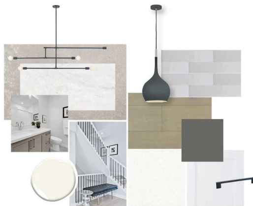
#2B, 3550 45 STREET SW MOOD BOARD - FINISHES & SPECIFICATIONS

*Images are for inspiration purposes only.